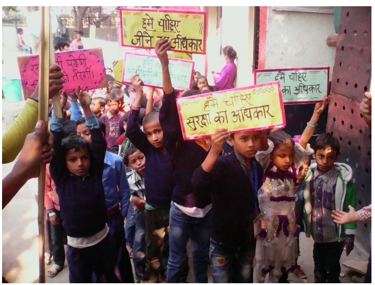
Empowerment for Rehabilitation Academic & Health (EFRAH)

Office Address: Community Centre, 2nd Floor, D D A Flats Kalkaji Behind central Market D D A Flats, kalkaji,New Delhi- 110019 Telephone Number- +91 11 26020132, 29946107, 29946270